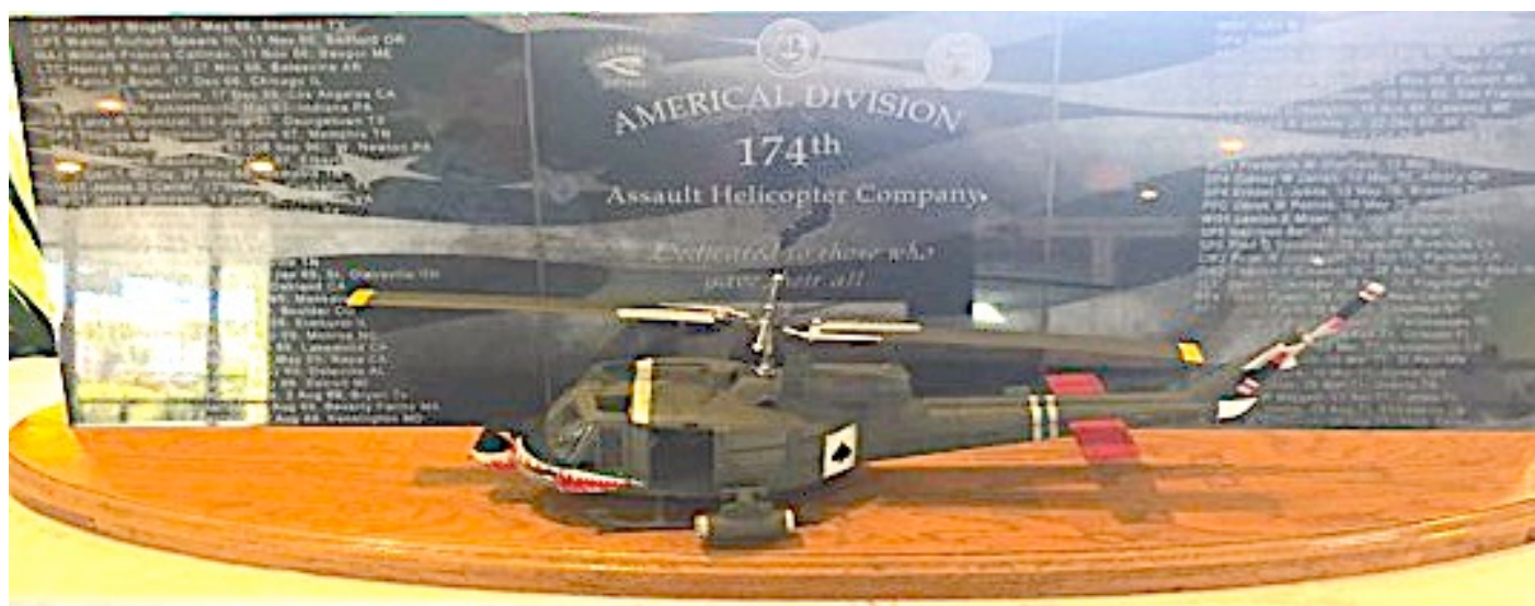
Memorial to those Members of the 174 th AHC lost in the Vietnam War