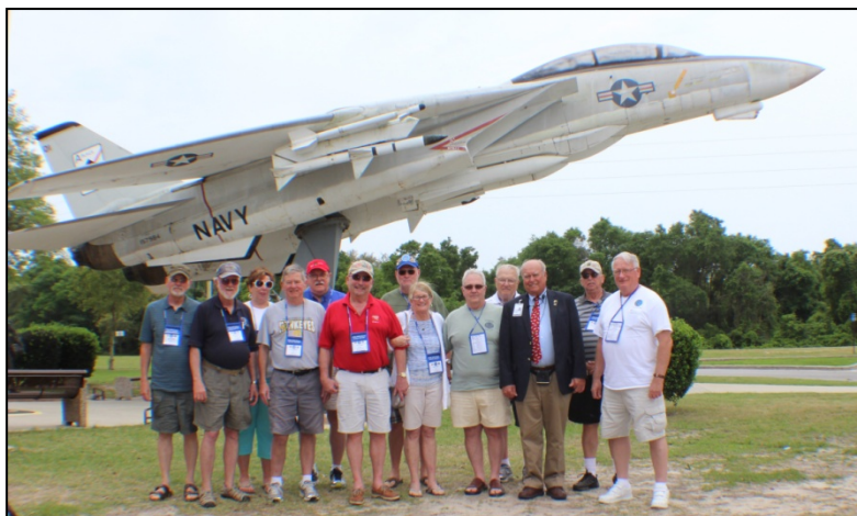
Some of the members who attended the museum tour